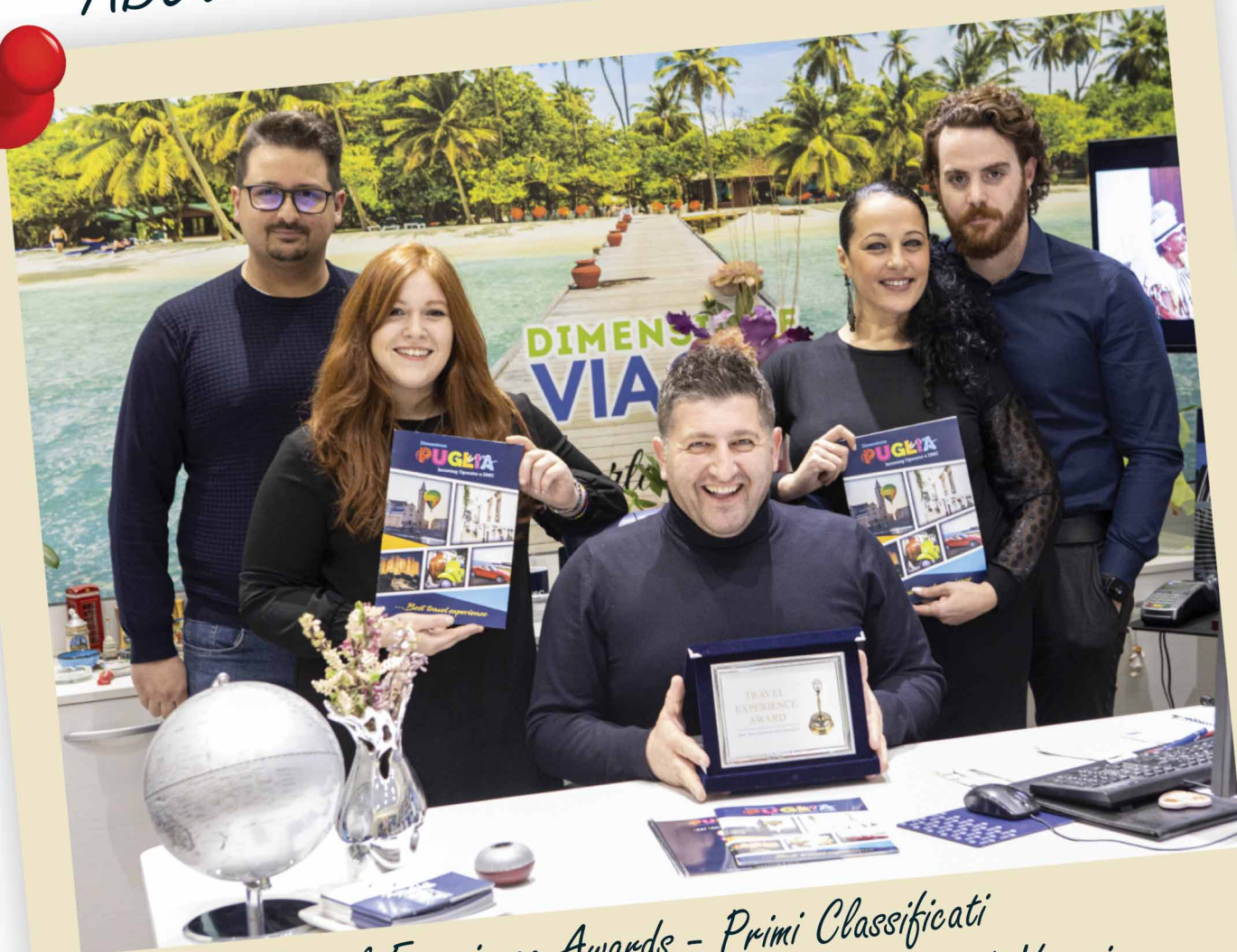
Travel Experience Awards - Primi Classificati Borsa Internazionale del Turismo Esperenziale di Venezia

—Don't just dream about Puglia, come and experience it with us—